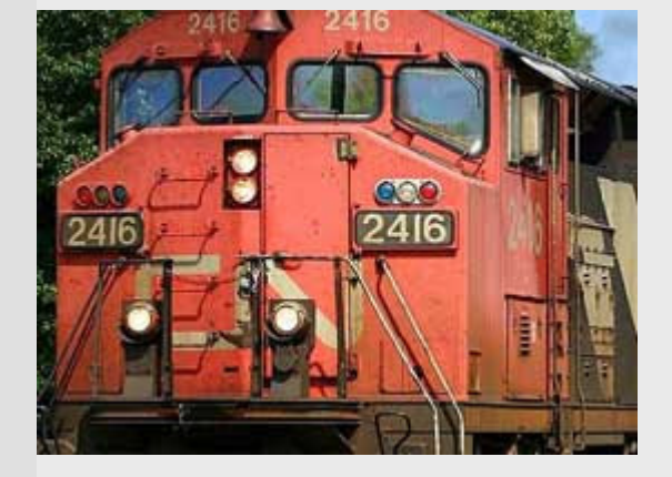
Unifor condemns CN Rail layoff announcement designed to line shareholders' pockets.